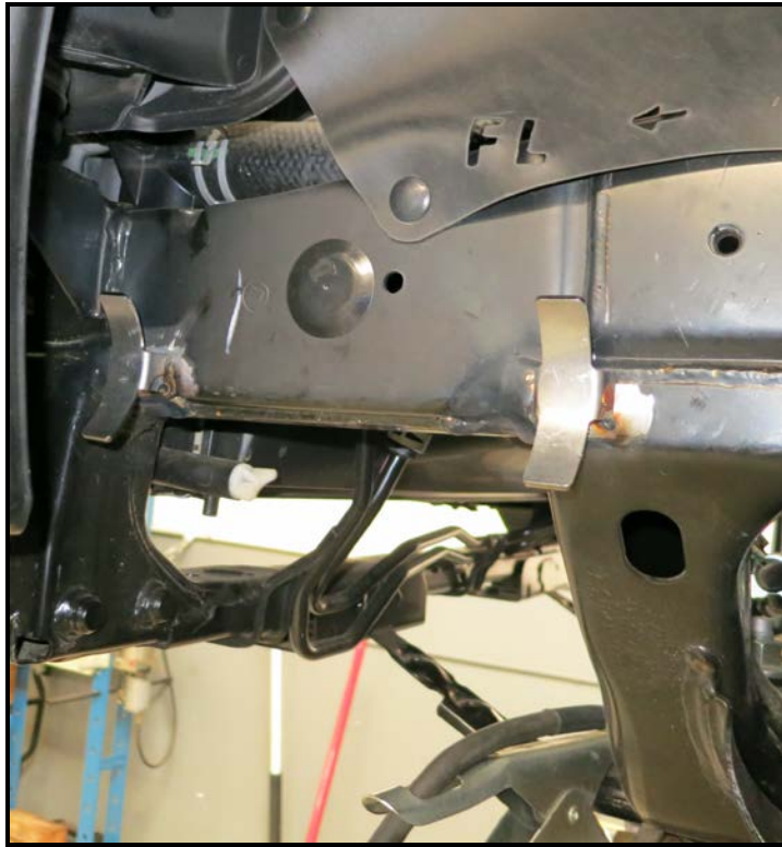
Finished install Picture