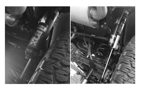
Fig. 6: Passenger's Side: Factory Race Series (Left), Performance Series (Right)