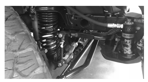
Fig. 4: (Passenger side): Factory Race Series 2.5 Reservoir