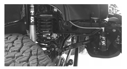
Fig. 5: (Passenger side): Performance Series 2.0 Reservoir

PERFORMACE SERIES SHOCKS: Zip tie the reservoir hose with the included zip ties so that it does not protrude into the wheel well. Fender trimming can be done to make the reservoir hose more visible.