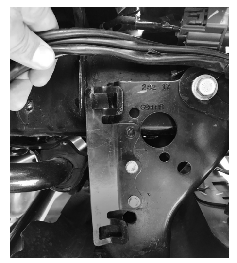
Fig. 3 (passenger side): Performance Series 2.0 Reservoir Bracket.

shocks, ensure that the bracket is facing the rear of the vehicle. (Fig. 3). Ensure the bracket is straight vertically. Drill the remaining pilot holes and install self-tapping screws.