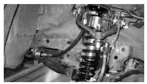
Fig. 2: Driver side

and towards the front of the vehicle (Fig. 2). Connect the top shock hat to the vehicle using the bolts and washers provided or with Performance Series models connect the top shock hat to the vehicle using the nuts provided. Tighten all three bolts or nuts to 24 ft* lbs.