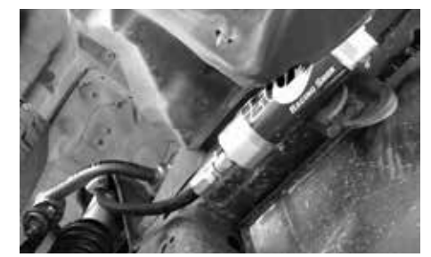
Fig. 4: Passenger side