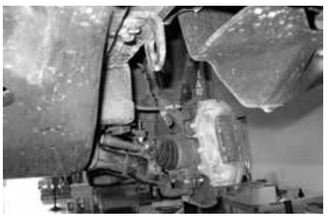
Fig. 3: Driver side